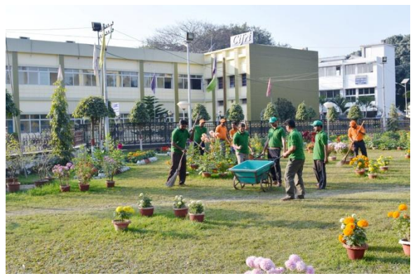
Beautification of Institute's Garden