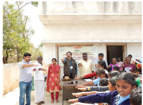
Oath taking ceremony at a School at Manchanabele reservoir site