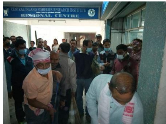
Visit of the Hon'ble Minister of Fisheries Government of Assam