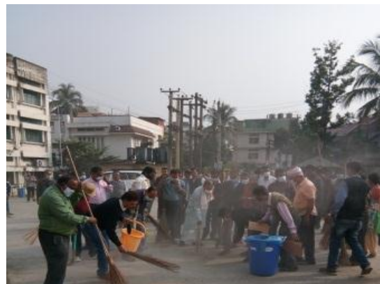
Swachhta activities at Guwahati Centre