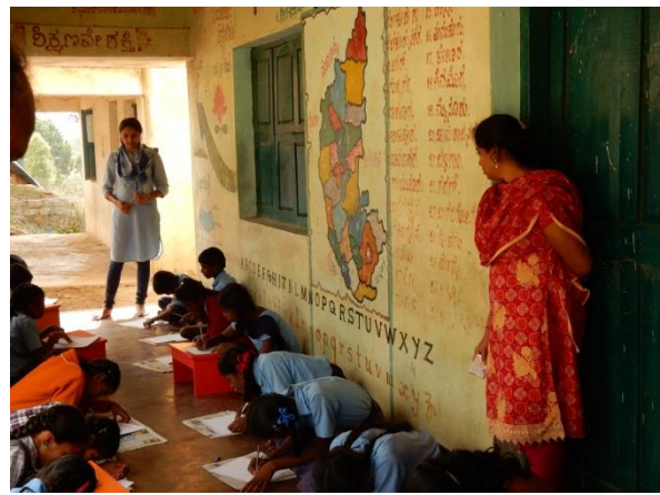
Essay competition by the students

Swachhta activities by the Officials at Guwahati Centre:- Hon'ble Minister of Fisheries, Govt. of Assam Sri Parimal Suklbadyaji participated in the special Swachh Bharat Abhiyan organized by Regional Centre of ICAR-CIFRI, Guwahati in collaboration with Department of Fisheries, Govt. of Assam, Guwahati (led by Mr. S. K. Das, ACS, Director of Fisheries), O/o the Commissioner of Excise, Govt. of Assam, Guwahati and HOUSEFED Society, Guwahati on 25 th December, 2016. In the day long programme the entire HOUSEFED office complex was cleaned by the combined effort of the employees of the participating departments/ organizations. The Hon'ble Minister thanked all the employees for whole heartedly participating in the activity specially organized on the occasion of birth day of Sri Atal Bihari Bajpaiji, Former Prime Minister of India in response to his request.