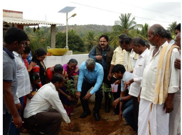
Tree plantation Ceremony covered by Doordarshan